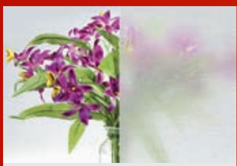
Brushed Crystal (NRMV BC)