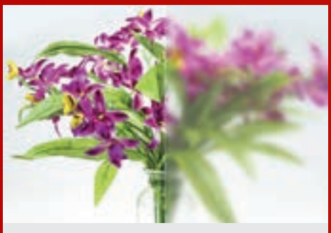
Satin Crystal Clear