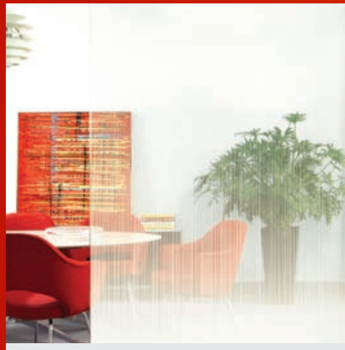
Grass Blade Gradient