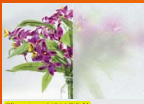
Fiberglass (NRM FIBG)