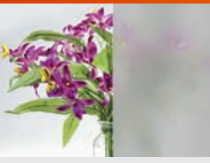
Silver (RMS PS2)