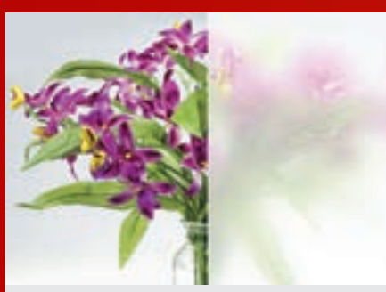
Satin Crystal (NRMV SC)