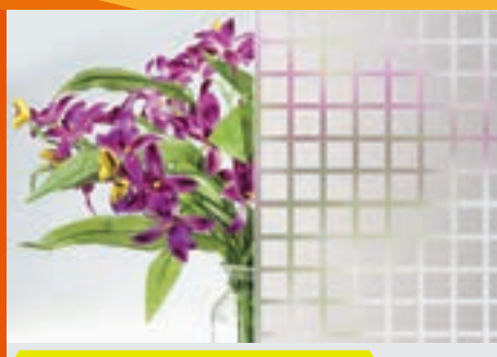
Matte Squares (NRM MSQ)