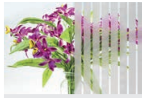
Medium Etched Stripes