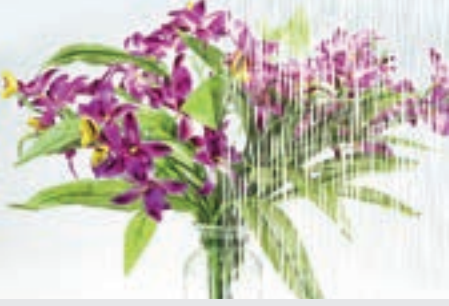
White Wood Grain (shown on cover)