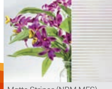
Matte Stripes (NRM MFS)