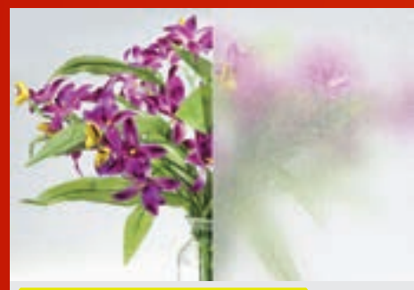
Crackled Glass (NRMV CG)